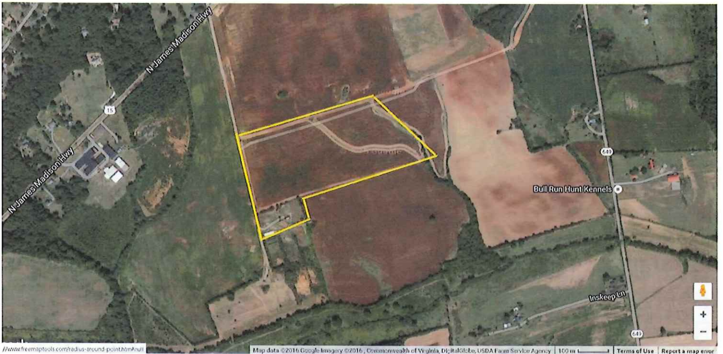
General Use Area