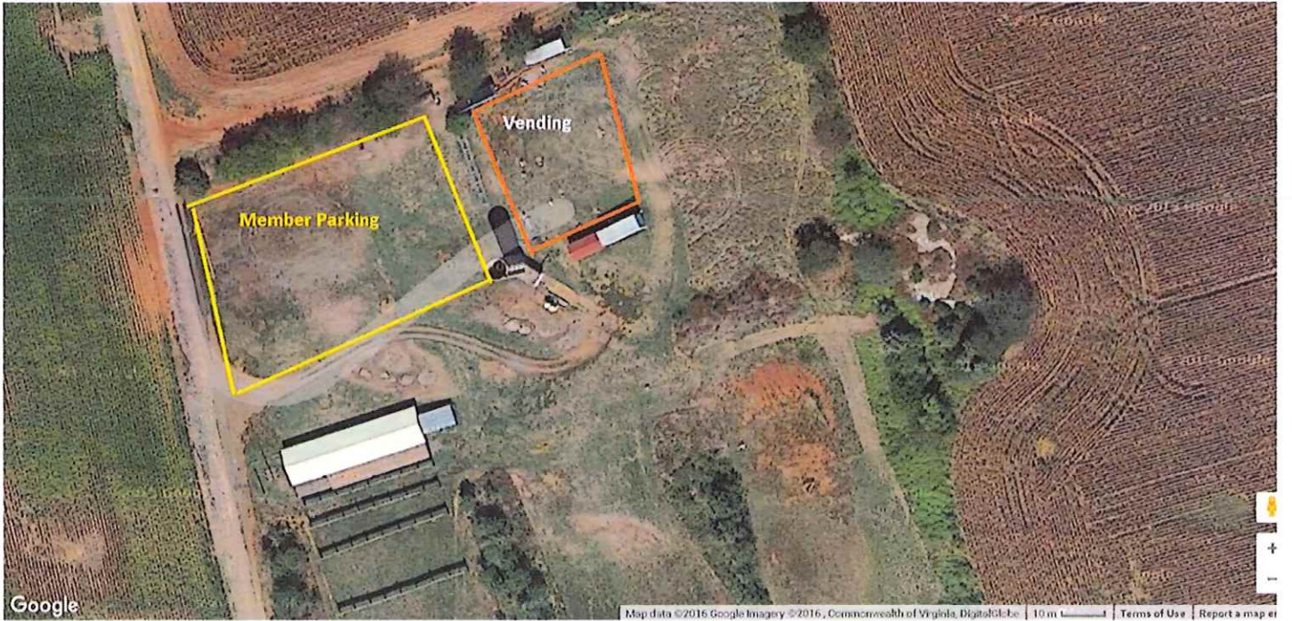
Member Parking and Vending Areas