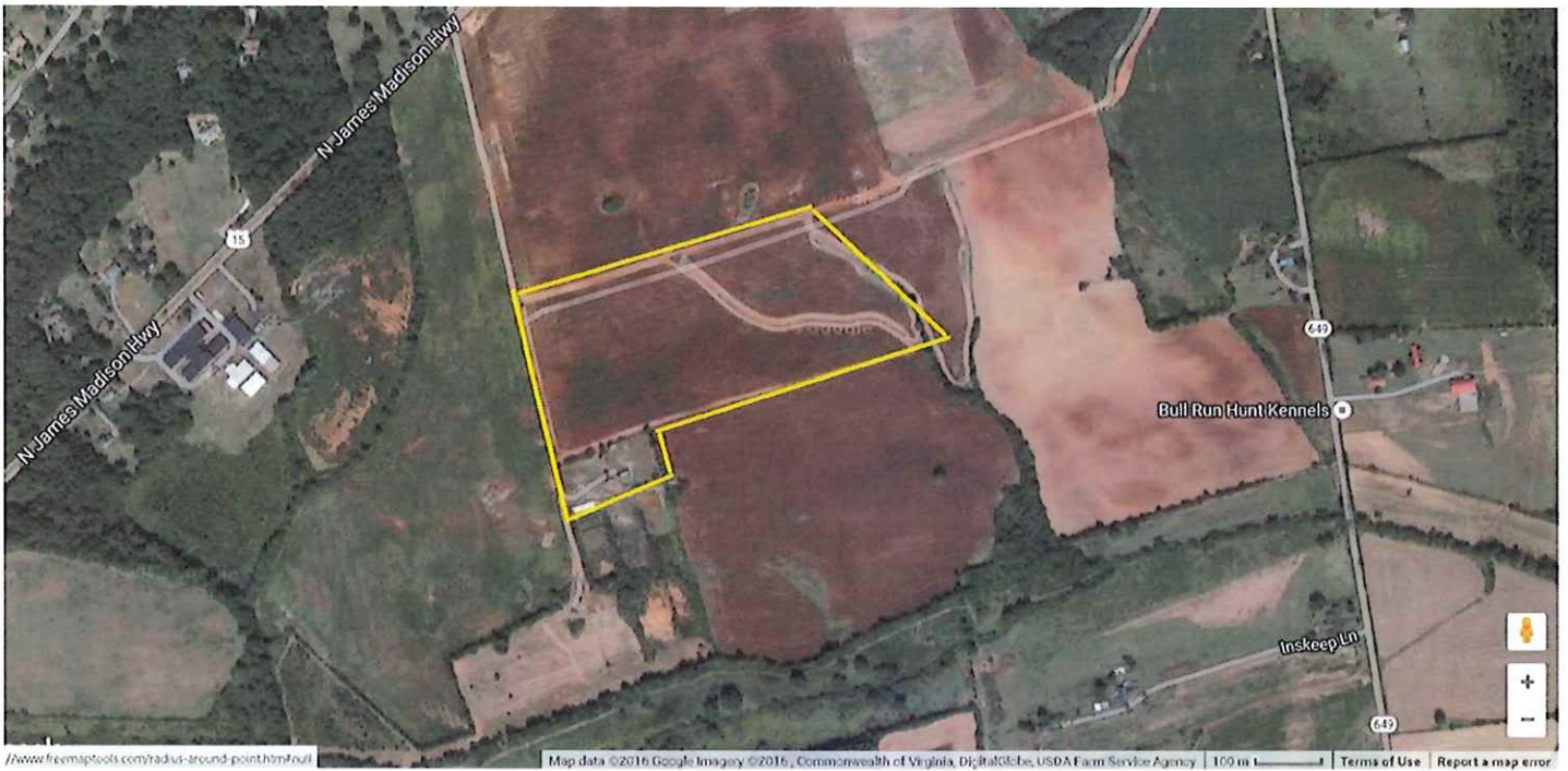
General Use Area