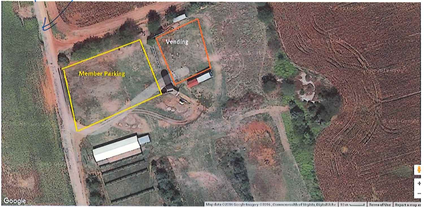
Member Parking and Vending Areas