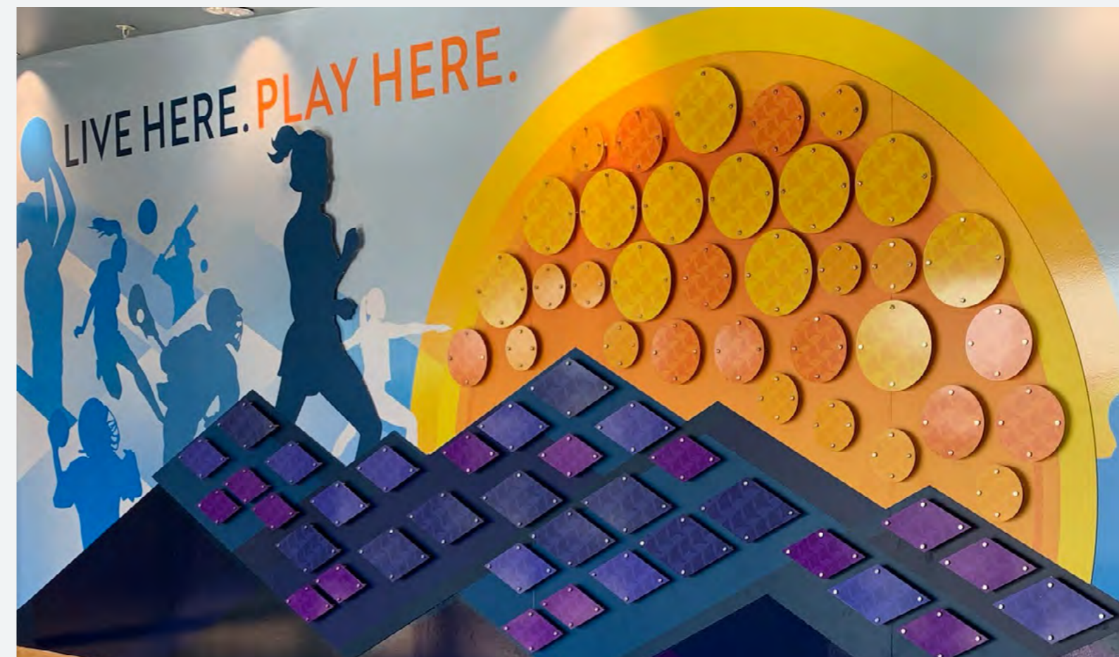
Image: Donor Wall at the Culpeper County Fieldhouse