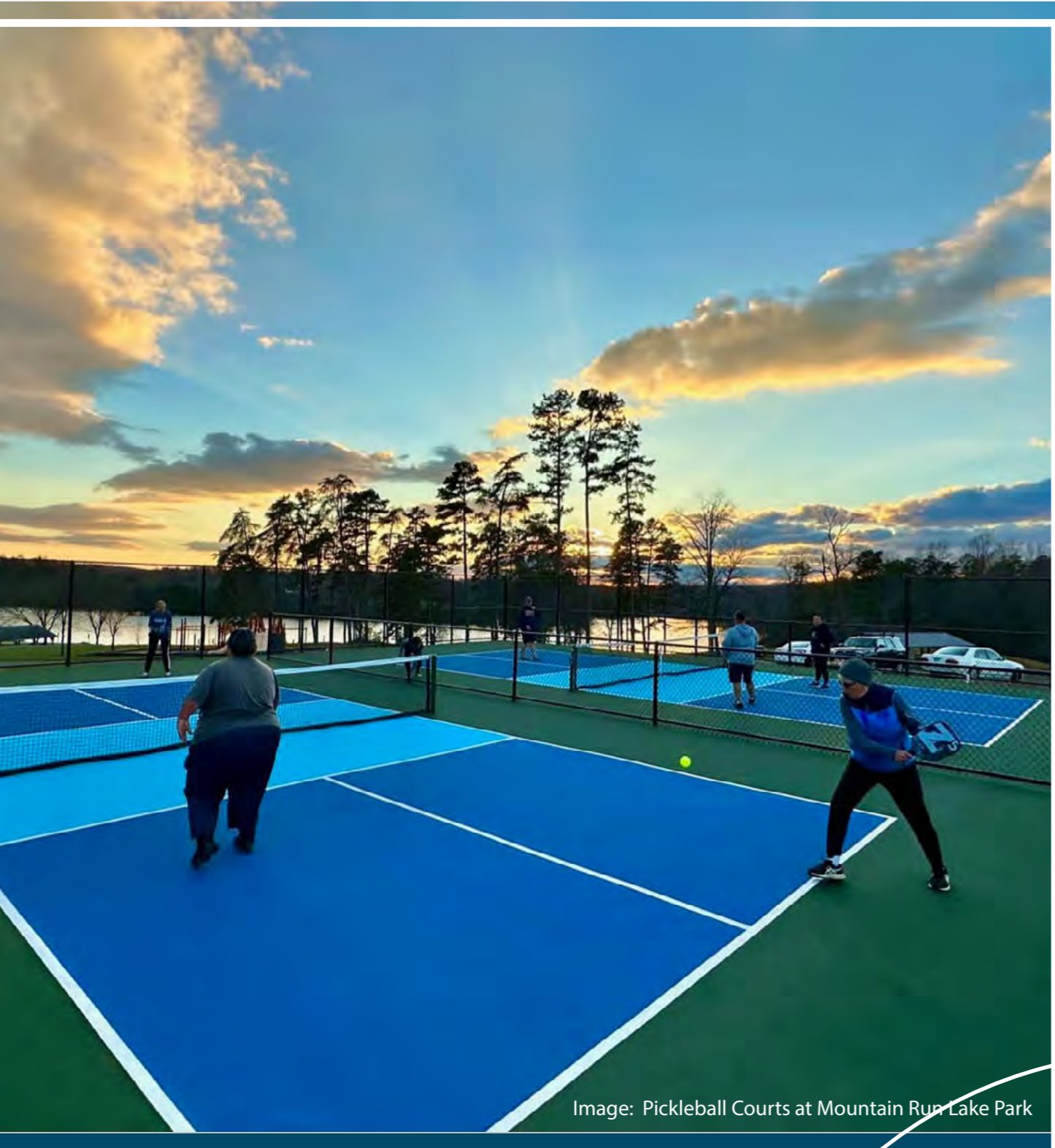
Image: Pickleball Courts at Mountain Run Lake Park

“Unless someone like you cares a whole awful lot, nothing is going to get better. It’s not.”