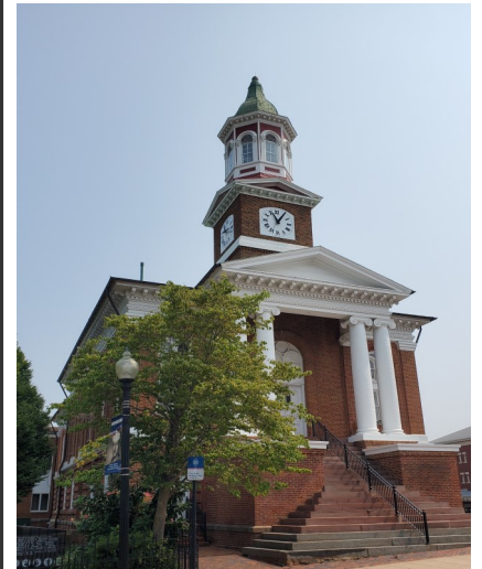
Culpeper County Courthouse