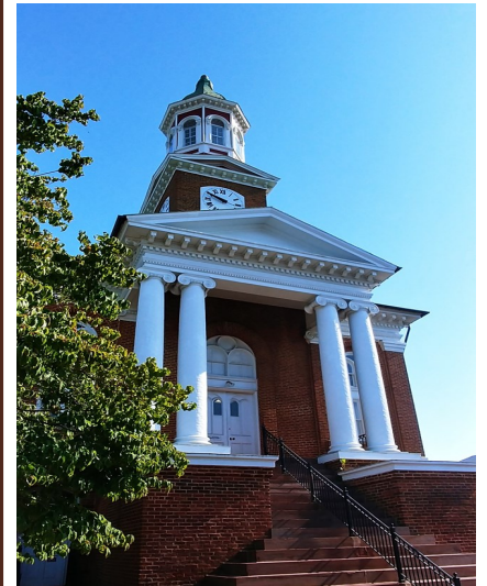
Culpeper County Courthouse