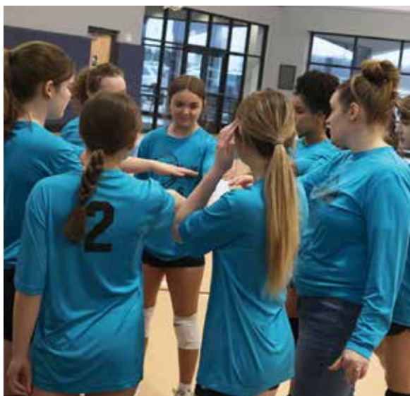
Middle School Volleyball League (MSVL)