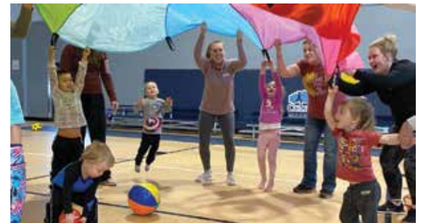
Special Olympics - Youth Athletes Program