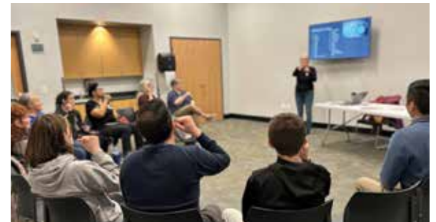
Learn American Sign Language

Register By: 7/21 Cost: $20 M, 7/27 10:00a-11:00a #3092