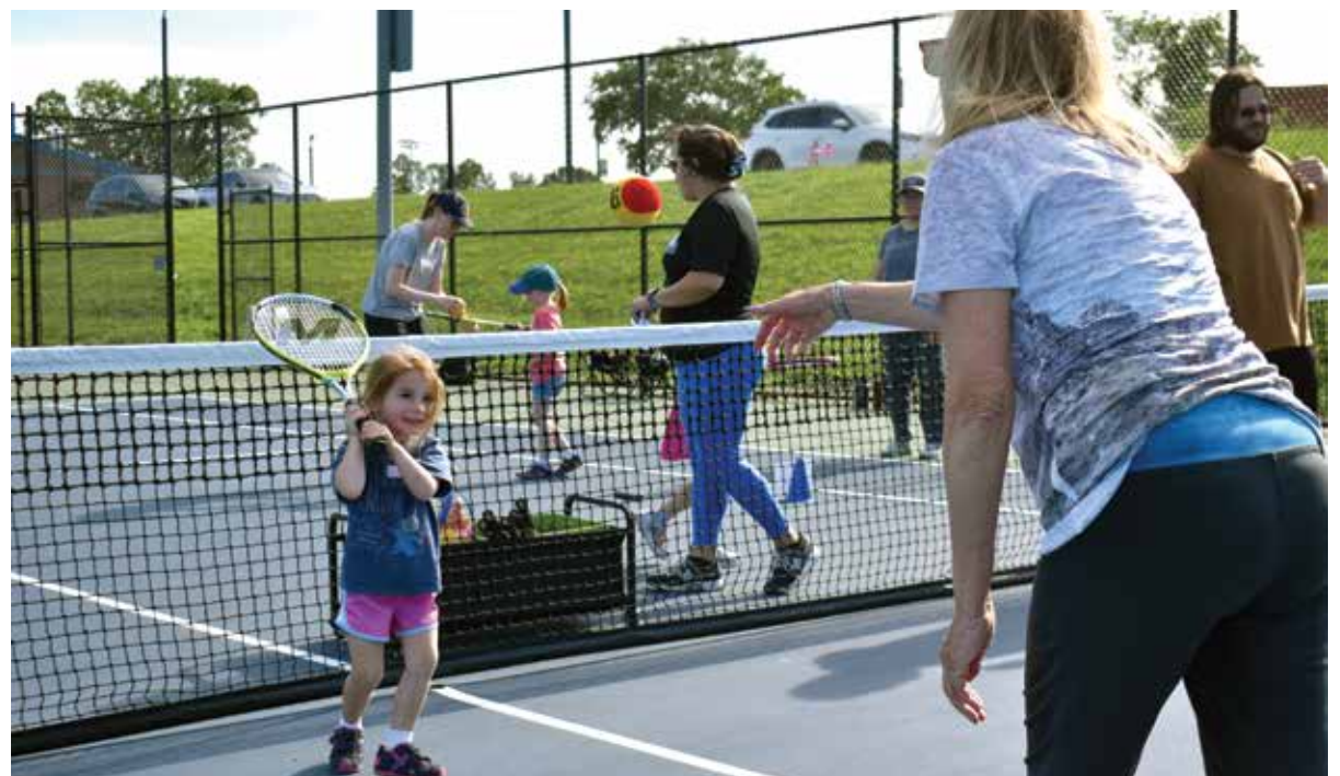
Scholarship can be used for a variety of Athletic programs