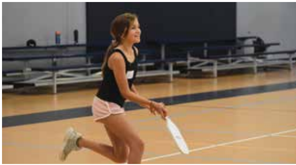
Pickleball: The Basics for Youth