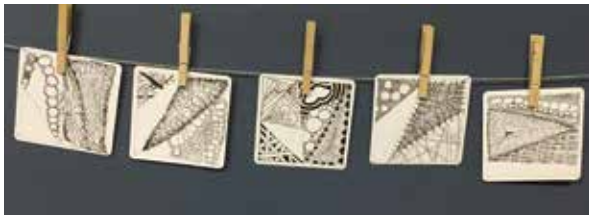
Art Jam: Zentangle