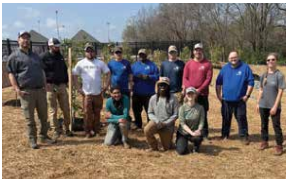
Landscaping Volunteers at the Culpeper Community Pool