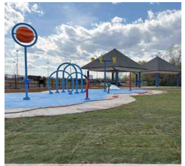
Landscaping at the Culpeper Community Pool