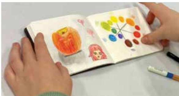
Art Jam: Sketch Club