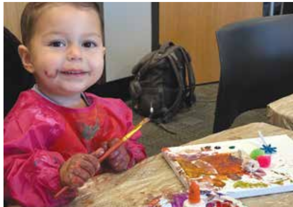
Little hands, BIG ART

Register By: 6/8 Cost: $8 F, 6/12 10:00a-11:00a #2857 Register By: 7/6 Cost: $8 F, 7/10 10:00a-11:00a #2858 Register By: 8/10 Cost: $8 F, 8/14 10:00a-11:00a #2856