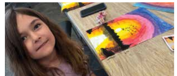
Kaleidoscope Art Camp

Register By: 5/26 M-F, 6/1-6/5 1:00p-2:30p Cost: $45 #2539