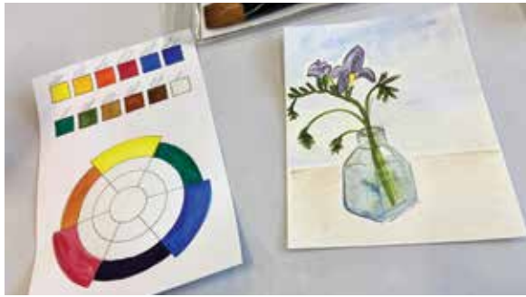
Art Jam: Watercolor Workshop

Program descriptions are very concise in this newsletter due to space limitations. For more detailed information, please visit the online registration page.