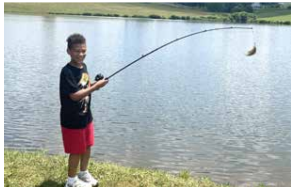
Park Explorers Camp