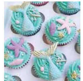
Cupcakes: Under the Sea

We've "got gadgets and gizmos a-plenty" for this colorful session where participants will decorate cupcakes with beautiful ocean inspired designs using colorful icing, piping techniques, and fun toppings. *Ages 7-11 must have adult stay on-site.