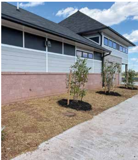
Landscaping at the Culpeper Community Pool (Trees)