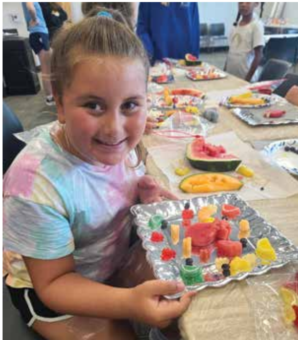
No-Stove Kids' Cooking Series

Register By: 7/1 Cost: $100 Tu,W,F, 7/7-7/17 9:00a-12:00p #3095