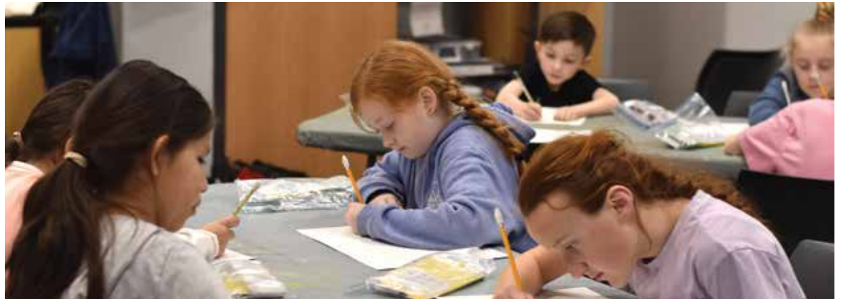
Scholarship can be used for a variety of Art Classes