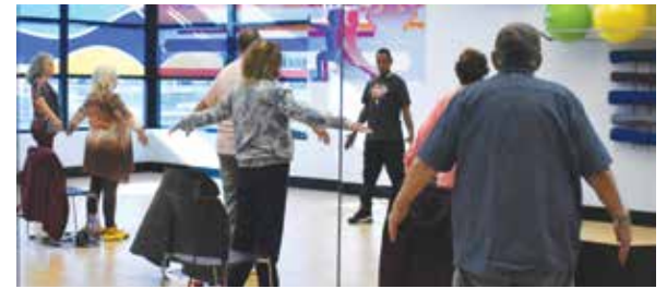
Fit & Well