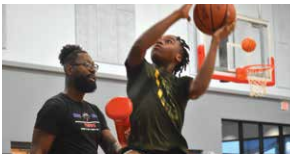
Let's Get Better Basketball Camp