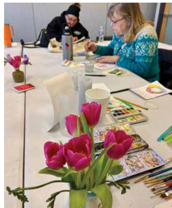
Art Jam: Watercolor Workshop