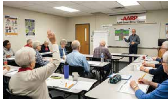
AARP Smart Driver Course

Register By: 6/22 Th, 6/25-8/20 6:30p-7:30p Cost: $100 #3081