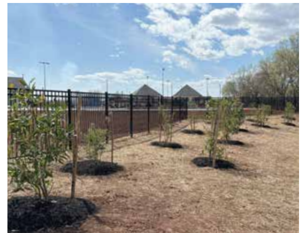
Landscaping at the Culpeper Community Pool (Bushes)