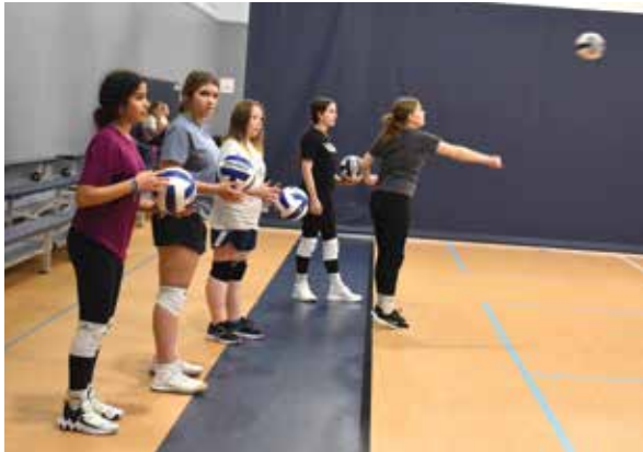
Volleyball Tryout Prep

Register By: 5/25 Cost: $20 Th, 5/28 5:30p-7:00p #2910