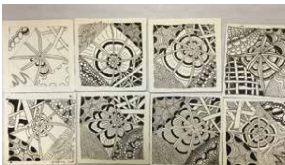
Art Jam: Zentangle

If you've been looking for a creative outlet or simply a relaxing way to spend an afternoon or weekend, consider joining an Art Jam class. Whether you're picking up a brush for the first time or returning to art after years away, you'll find inspiration waiting in the classroom.