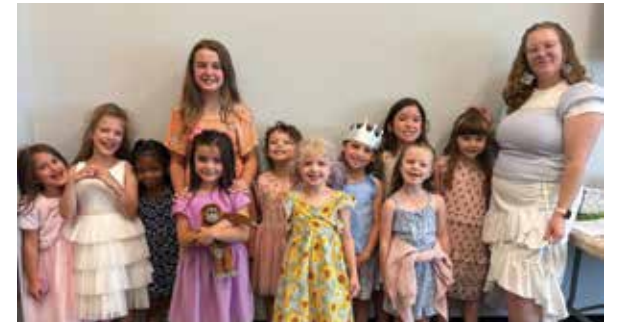
Tiny Teacups: Manners Tea Party

Register By: 7/10 Tu, 7/14&7/28 9:00a-9:50p Cost: $45 #2992