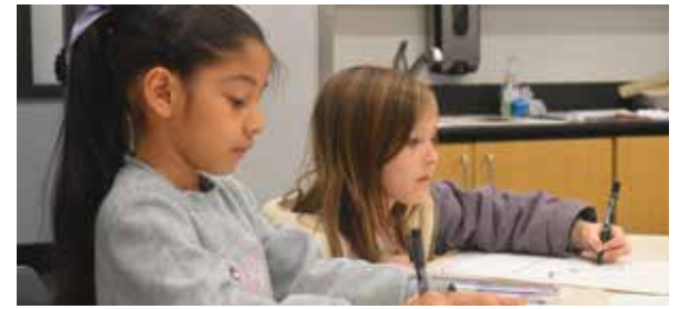
Drawing & Painting for Kids

Register By: 7/17 Cost: $12 Tu, 7/21 2:00p-3:30p #2976