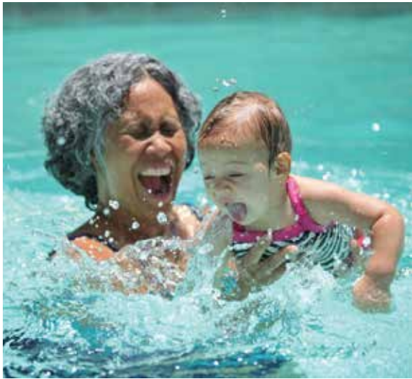
Infant/Toddler Swim Lesson