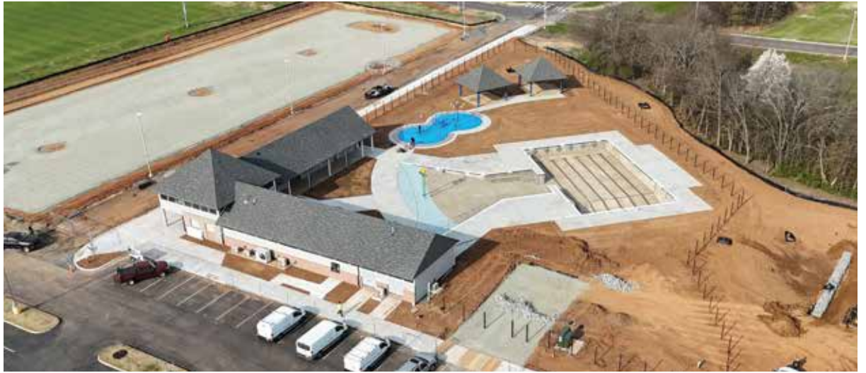
Aerial of the Culpeper Community Pool

In addition to UVA Health Culpeper Medical Center, the Department would also like to extend a special thank you to the many community partners that have assisted with the construction and operation(s) of the Culpeper Community Pool such as the Friends of the Rappahannock, Eastern View FFA Club, Culpeper County Extension Office, Mom-2-Mom, Mid-Day Lions Club, Pearl Sample Leaders of the Pack, and the Rappahannock Electric Cooperative.